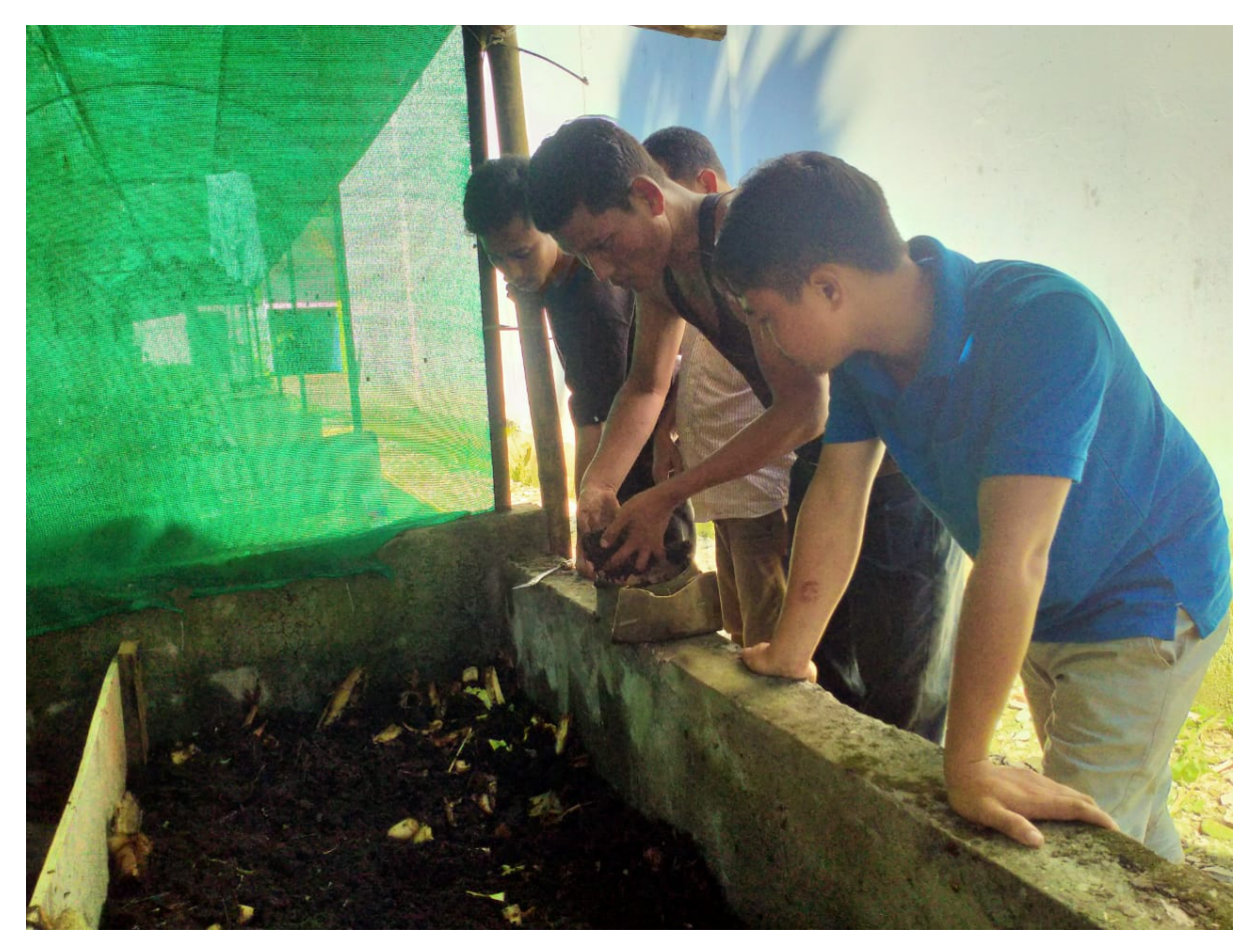
Vermi Composite Pit, a photo at the time of taught about Vermi composite, Silapathar Town College