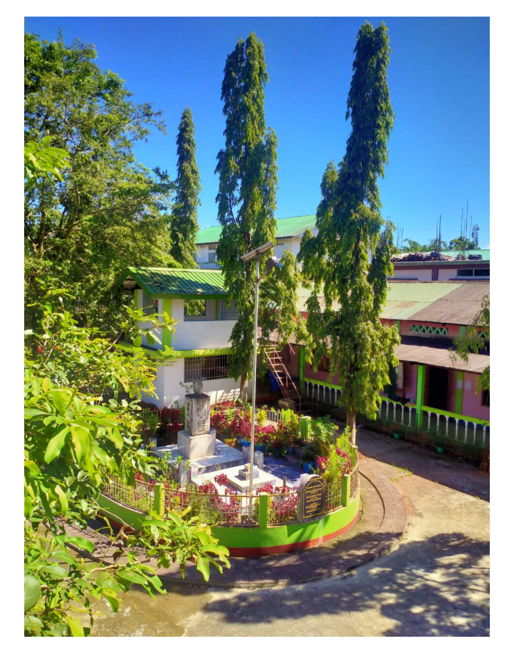
Greening Campus, maintains by ECO-Club, Silapathar Town College